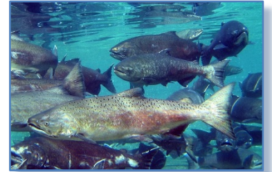
Pacific Northwest National Laboratory