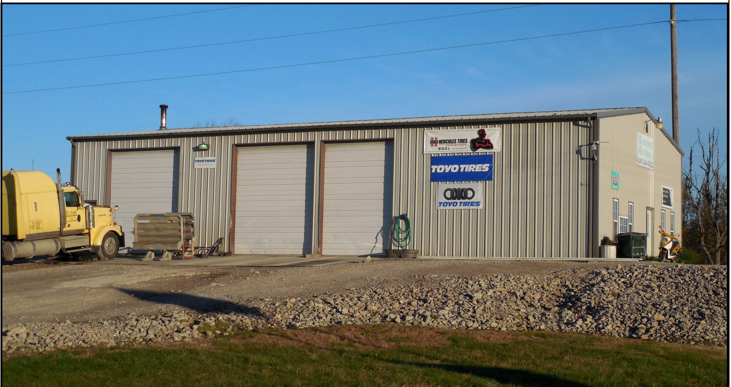
Tire shop elevated on fill near Highway 59 in Erie.